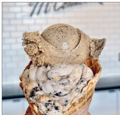
Santa Barbara's McConnell's Fine Ice Cream is opening its first Orange County scoop shop Nov. 21 at the River Street Marketplace in San Juan Capistrano.

The Outlets at San Clemente will unveil its Santa Clemente Village installation at its 10th annual Tree Lighting Concert and Ceremony at 5 p.m. Saturday. The village includes Santa's