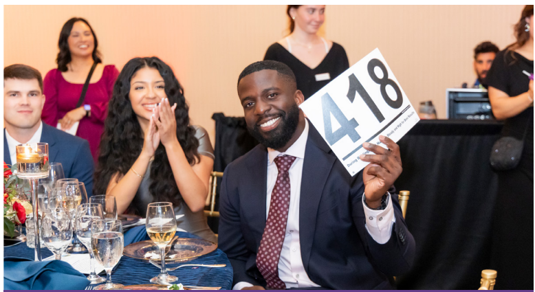
A supporter raises his paddle during the 2025 event.