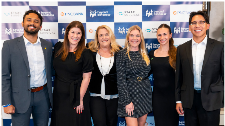
PNC Bank team arrives at the 2025 event.