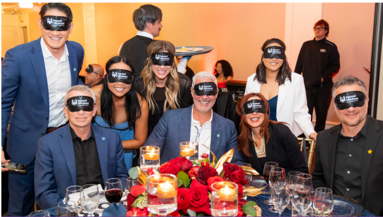
Glaukos team celebrates at the 2025 event.