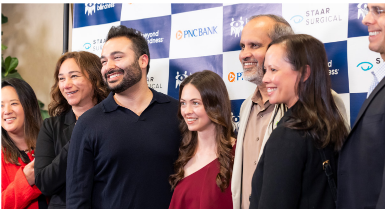
Tarsus team celebrates at the 2025 event.